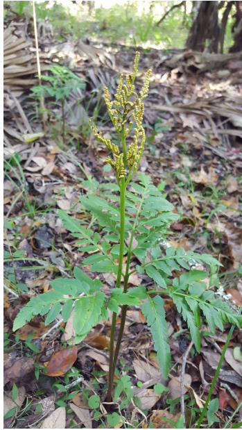
Southern grapefern in Shingle Creek Swamp

Edwin Bridges and Gary Reese who cataloged 664 native plant taxa in the Upper Kissimmee Basin. Having worked on smaller portions of Reedy Creek and Shingle Creek swamps within the Upper Kissimmee Basin, I have documented over 300 native plant taxa on various wetland mitigation and restoration projects.