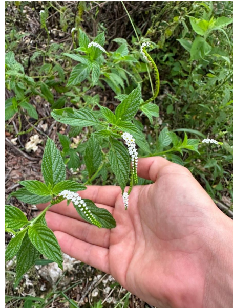
Scorpion tail ( Heliotropium angiospermum )

IRC has an E-Trade account. Please contact us about giving gifts of stock.