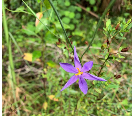
Celestial lily growing along the edge of a hammock adjacent to Reedy Creek Swamp

the flora. Some such species that I have documented that may be more familiar to the reader include white stopper ( Eugenia axillaris ), interestingly growing on a midden in the middle of Reedy Creek Swamp, and the imperiled toothed lattice-veined fern ( Thelypteris serrata ).