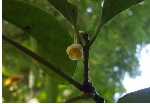
Yellow anisetree in Reedy Creek Swamp