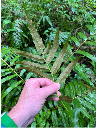
Toothed lattice-veined fern in Shingle Creek Swamp