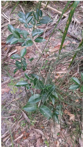
White stopper growing on a midden in Reedy Creek Swamp

the flora. Some such species that I have documented that may be more familiar to the reader include white stopper ( Eugenia axillaris ), interestingly growing on a midden in the middle of Reedy Creek Swamp, and the imperiled toothed lattice-veined fern ( Thelypteris serrata ).