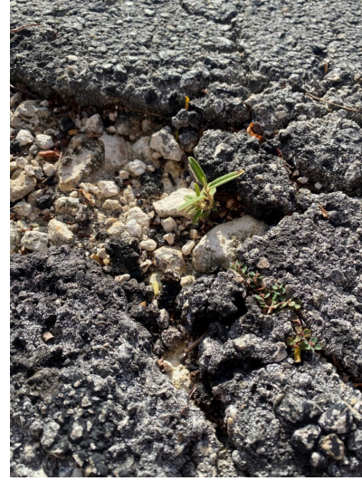
A pineland croton seedling, sole larval host for the endemic Bartram’s scrub-hairstreak butterfly, recruits in degrading asphalt pavement in the Richmond Pine Rocklands.