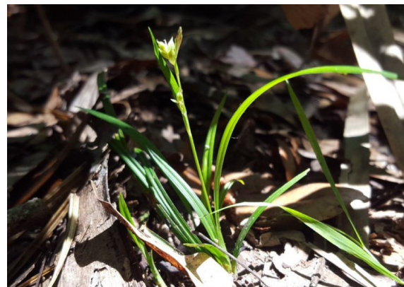
Chapman's sedge in Reedy Creek Swamp