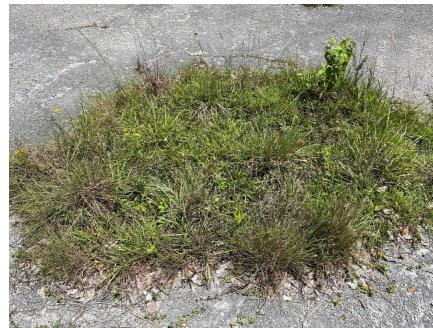
Pine rockland plants break through the asphalt north of Zoo Miami.